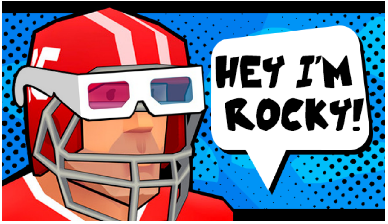
Hey I'm Rocky, almost Bolboa, only way cooler. I need some cash to chill with my little naughty girl. Hope you got it, how I'm gonna do it and I need your help. And yes, mate, I'm gonna do it in the crazy game of FootRock.